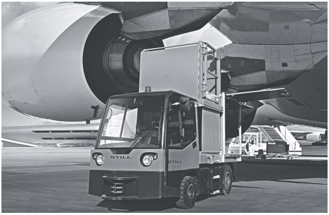
R 08 electric platform truck with optional aerial work platform and assembly platform