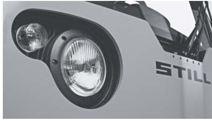
Front light for safe driving in all lighting conditions