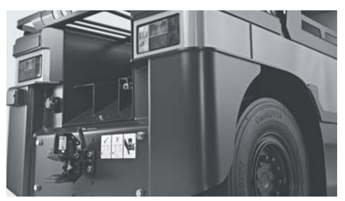
R 07 electric tractor: trailer coupling for use as a towing vehicle