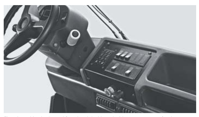
Electric parking brake and functional dashboard with compartments for documents and working materials