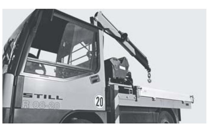
Optional built-in crane for lifting heavy loads