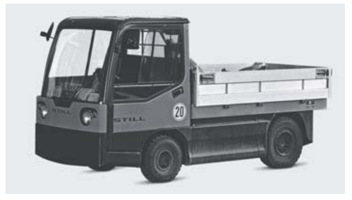
Optional aluminium side boards suitable for all kinds of transport