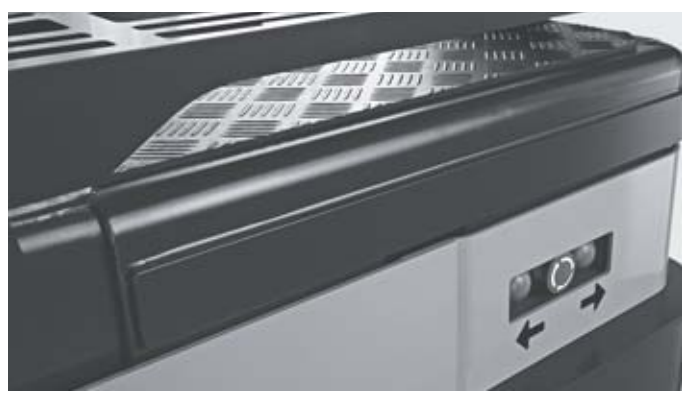
Reversing device for driving safely and precisely up to the trailer