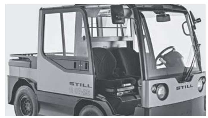
Optional compact sliding door for easy entry and exit even in confined spaces