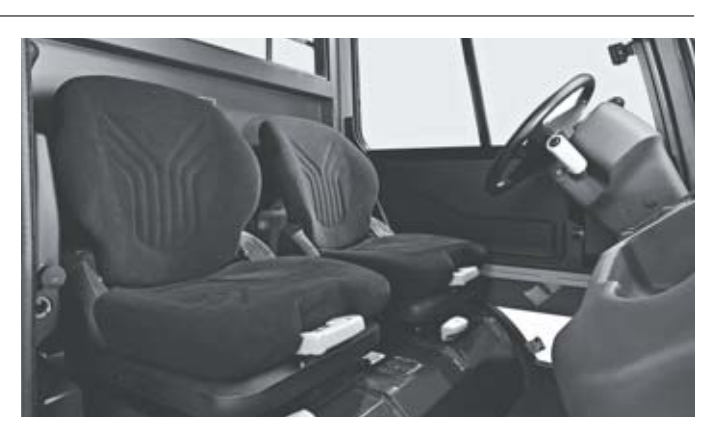
Comfortable cab for a pleasant ride